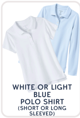
WHITE OR LIGHT BLUE POLO SHIRT (SHORT OR LONG SLEEVED)