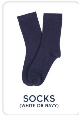
SOCKS (WHITE OR NAVY)