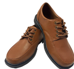
DRESS SHOES (BROWN OR BLACK)