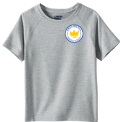
PCA GYM T-SHIRT