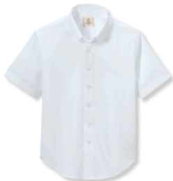
WHITE DRESS SHIRT (SHORT OR LONG SLEEVED)