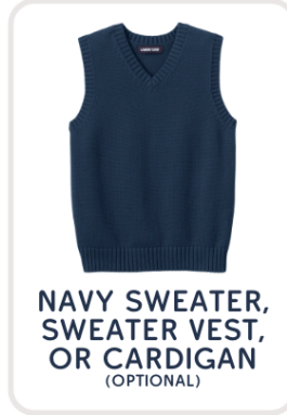
NAVY SWEATER, SWEATER VEST, OR CARDIGAN (OPTIONAL)