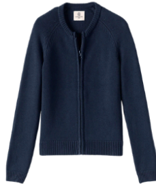
NAVY CARDIGAN (OPTIONAL)

to be worn on Chapel Wednesdays and other formal days as announced throughout the year