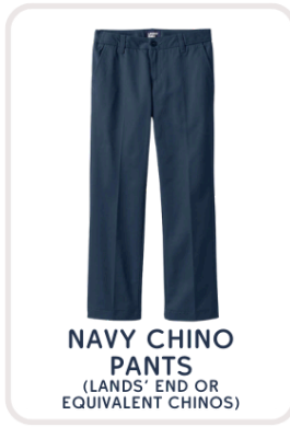
NAVY CHINO PANTS (LANDS' END OR EQUIVALENT CHINOS)