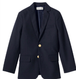
SOLID COLOR NAVY BLAZER (OPTIONAL)

to be worn on Chapel Wednesdays and other formal days as announced throughout the year