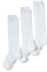
KNEE/ANKLE SOCKS OR TIGHTS (WHITE OR NAVY)