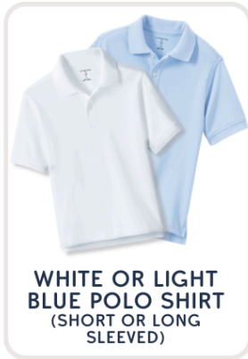
WHITE OR LIGHT BLUE POLO SHIRT (SHORT OR LONG SLEEVED)