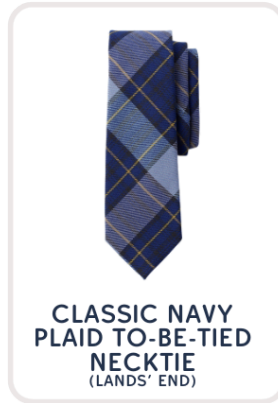
CLASSIC NAVY PLAID TO-BE-TIED NECKTIE (LANDS' END)