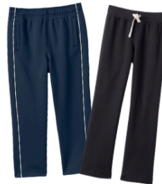
TRACK PANTS OR JOGGERS (NAVY OR BLACK)