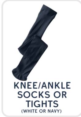
KNEE/ANKLE SOCKS OR TIGHTS (WHITE OR NAVY)