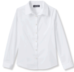
WHITE DRESS SHIRT (SHORT OR LONG SLEEVED)