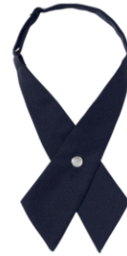
NAVY CROSS TIE (LANDS' END)