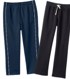
TRACK PANTS OR JOGGERS (NAVY OR BLACK)