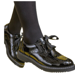
DRESS SHOES (BROWN, BLACK, NAVY BLUE, OR WHITE)

Black or navy cartwheel or compression ("cyclist") shorts are to be worn under skirts.