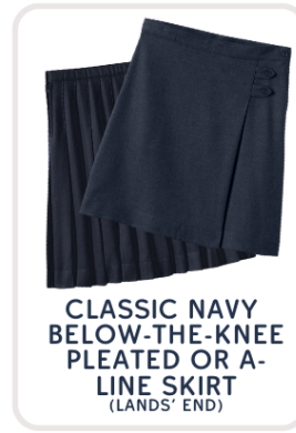
CLASSIC NAVY BELOW-THE-KNEE PLEATED OR A- LINE SKIRT (LANDS' END)