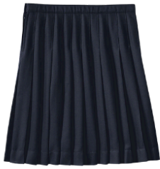
CLASSIC NAVY BELOW-THE-KNEE PLEATED SKIRT (LANDS' END)