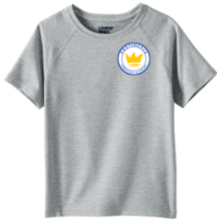
PCA GYM T-SHIRT