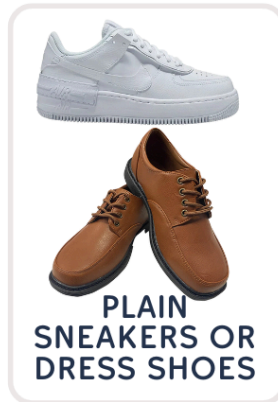
PLAIN SNEAKERS OR DRESS SHOES