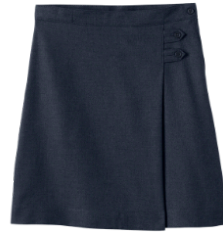
CLASSIC NAVY BELOW-THE-KNEE A-LINE SKIRT (LANDS' END)