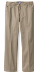
KHAKI CHINO PANTS (LANDS' END OR EQUIVALENT CHINOS)