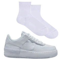
PLAIN ATHLETIC SHOES & SOCKS (NO CARTOON CHARACTERS, FLASHING LIGHTS, ETC)