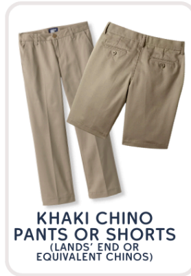
KHAKI CHINO PANTS OR SHORTS (LANDS' END OR EQUIVALENT CHINOS)