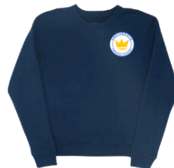
PCA NAVY CREWNECK SWEATSHIRT