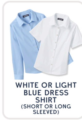
WHITE OR LIGHT BLUE DRESS SHIRT (SHORT OR LONG SLEEVED)