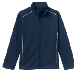
TRACK JACKET (OPTIONAL; NAVY OR BLACK)

To be worn to school on Tuesdays and Thursdays