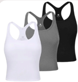
FULL LENGTH SPORTS BRA TANK TOP (WHITE, BLACK, GRAY, OR NAVY; TO BE WORN UNDER T-SHIRT)