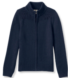
SOLID COLOR NAVY CARDIGAN (OPTIONAL)