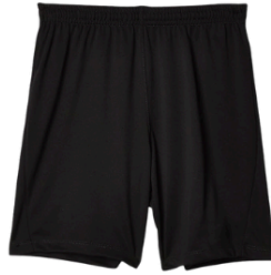
2-IN-1 KNEE-LENGTH ATHLETIC SHORTS (NAVY OR BLACK)