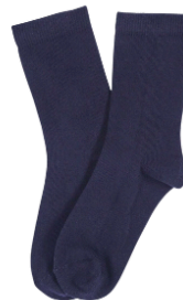
SOCKS (WHITE OR NAVY)