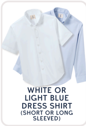
WHITE OR LIGHT BLUE DRESS SHIRT (SHORT OR LONG SLEEVED)